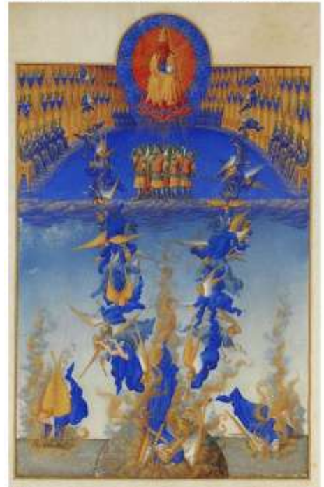
THE FALL OF THE REBEL ANGELS FROM LES TRÈS RICHES HEURES DU DUC DE BERRY (MINIATURE), C. 1410

Satan didn't leave heaven by meekness or gentleness. There was an all-out war. How long did that war last, what was the first shot heard around the heavens? The bible doesn't give that detail but the bible does state in Revelations 12:7-9 that Satan had gathered allies to his cause. Maybe some lower rank angels wanting a higher position or under the spell of the musical charm of satan (musical pipes in Ez28:13)